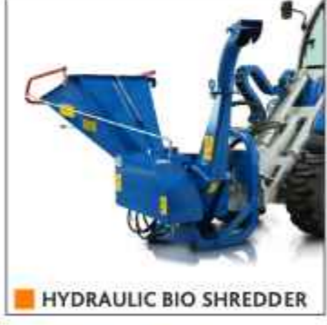
HYDRAULIC BIO SHREDDER