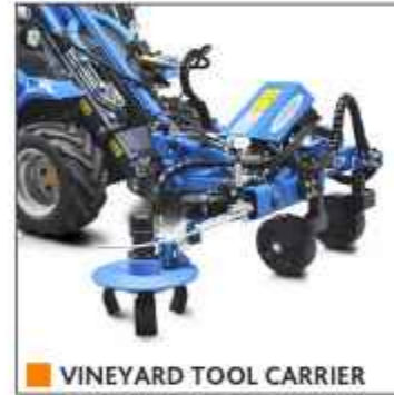
VINEYARD TOOL CARRIER