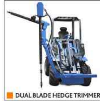
DUAL BLADE HEDGE TRIMMER