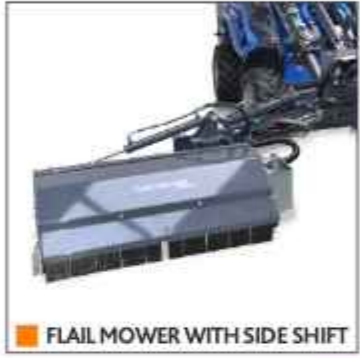
FLAIL MOWER WITH SIDE SHIFT