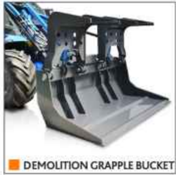
DEMOLITION GRAPPLE BUCKET