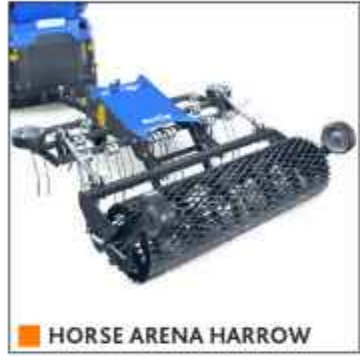
HORSE ARENA HARROW