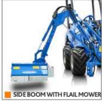
SIDE BOOM WITH FLAIL MOWER