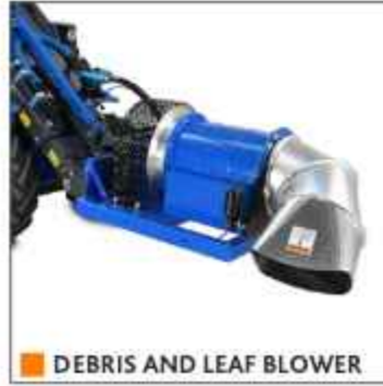
DEBRIS AND LEAF BLOWER