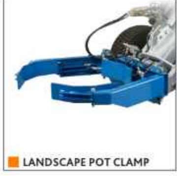
LANDSCAPE POT CLAMP