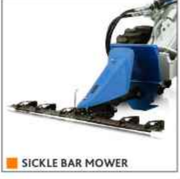
SICKLE BAR MOWER