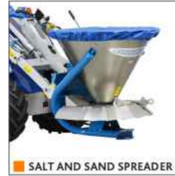
SALT AND SAND SPREADER