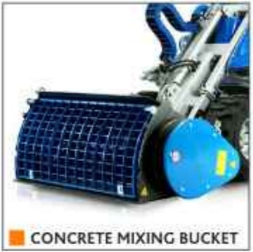
CONCRETE MIXING BUCKET