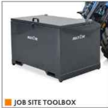
JOB SITE TOOLBOX