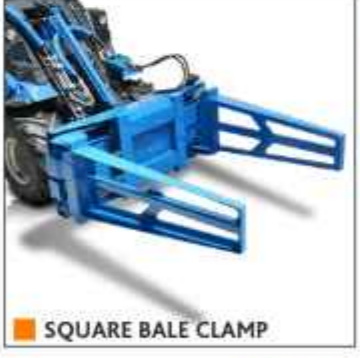
SQUARE BALE CLAMP