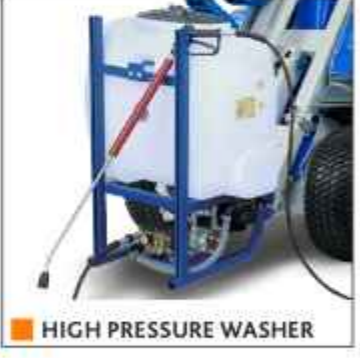
HIGH PRESSURE WASHER