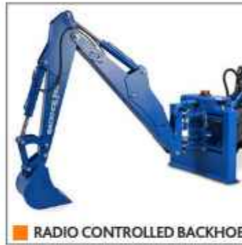
RADIO CONTROLLED BACKHOE