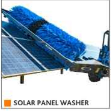
SOLAR PANEL WASHER