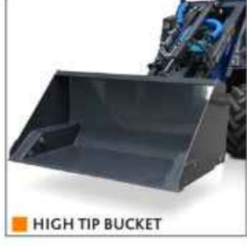
HIGH TIP BUCKET