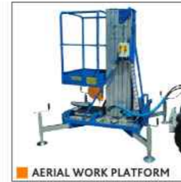
AERIAL WORK PLATFORM