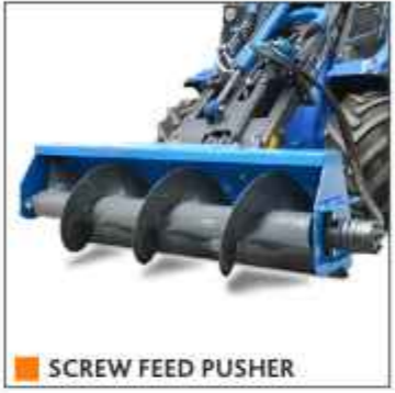
SCREW FEED PUSHER