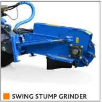
SWING STUMP GRINDER