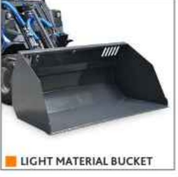
LIGHT MATERIAL BUCKET