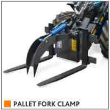
PALLET FORK CLAMP