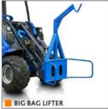
BIG BAG LIFTER